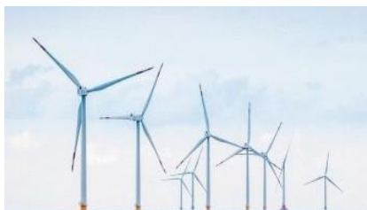
ENERGY AND NATURAL RESOURCES