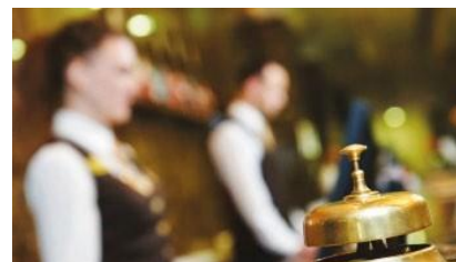
TOURISM, ENTERTAINMENT AND ACCOMODATION