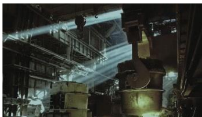
IRON AND STEE