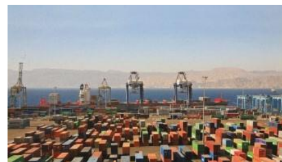
TRANSPORTATION AND LOGISTICS