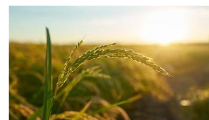
AGRICULTURE & FOOD